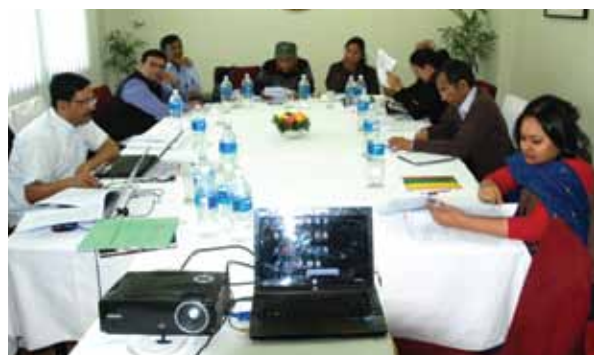
CoCooN- CCMCC inception workshop in Kathmandu

The Inception workshop for the project was organized on 11th -13th of February, 2014 in Hotel Himalaya, Kathmandu, Nepal. The meeting was attended by the project team members from Wageningen University, Netherlands; ICIMOD, Kathmandu, Nepal; Bangladesh University of Engineering and Technology (BUET), Dhaka, Bangladesh; Jagrata Juba Shangha (JJS), Khulna, Bangladesh; Nepal Engineering College, Kathmandu, Nepal; South Asia Consortium for Interdisciplinary Water Resources Studies (SaciWATERS), Hyderabad, India and MetaMeta, Kathmandu, Nepal. This kickoff workshop was organized to reflect on the proposal's objectives, deliverables, timeline etc and also to plan in detail the project activities for the coming one year.