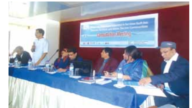
Consultation Meeting at CSS Ava Center February 12, 2013

Considering water conflicts and security are important issues of Southern part of the country, a consulting meeting was arranged on CSS Ava Center,