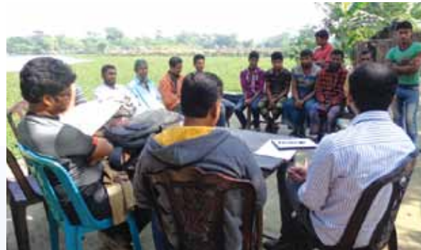
Focus Group Discussion

Focus Group Discussion was conducted for understanding conflict and cooperation around peri-urban areas. Both physical and socio-economic issues including industrial use, water logging, water/resource use, urban pocket, climate migration, etc. were considered in selecting of the study sites. Physical (e.g. canal, river) or virtual (e.g. groundwater transfer) 'water linkages' between the urban and peri-urban areas were also considered.