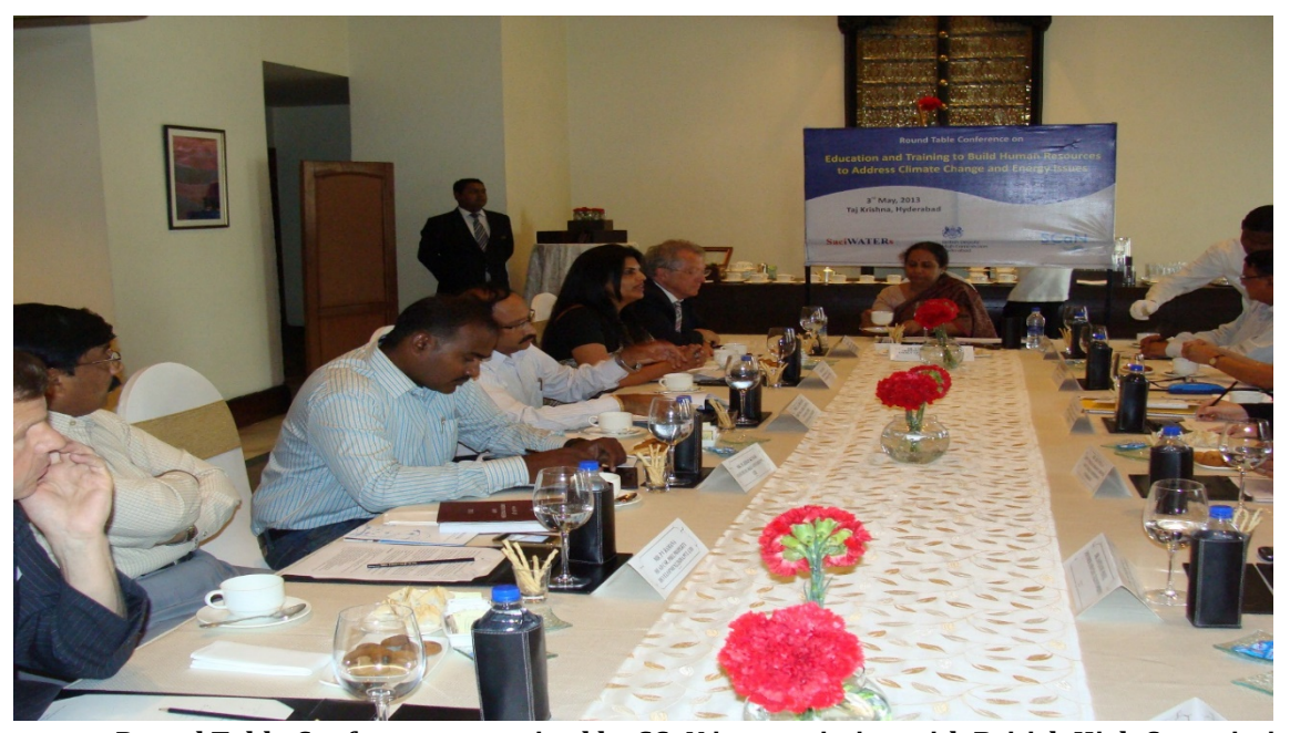
Round Table Conference organized by SCaN in association with British High Commission