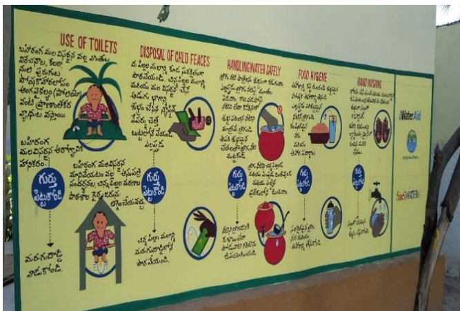
Photograph 11: Wall paintings on 5 key hygiene messages