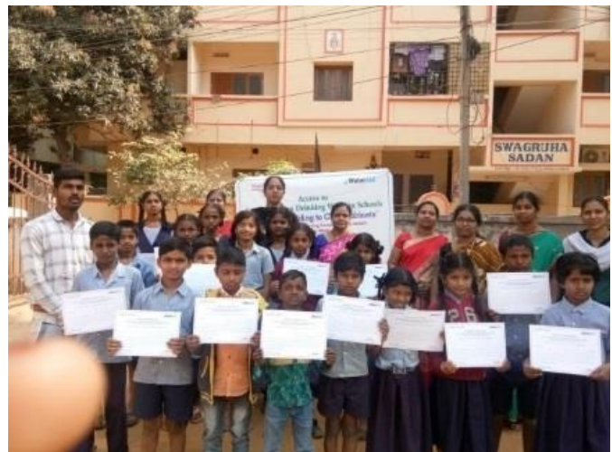
Photograph 8&9: Painting competition among child cabinet members