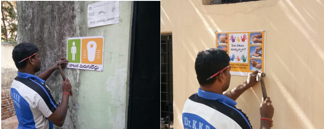
Photograph 13 & 14: Installation of IEC & signage boards