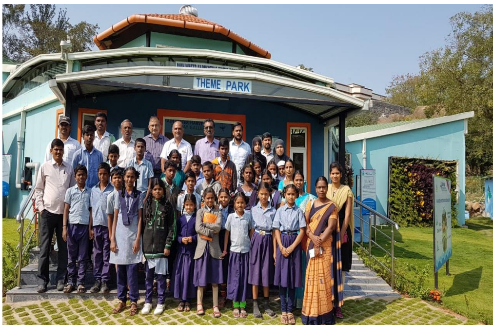
Photograph 7: Exposure visit of Child cabinet members to Rain Water Harvesting Theme Park