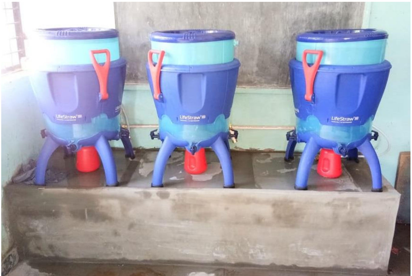
Photograph 1: Life Straw Water Filters in the schools