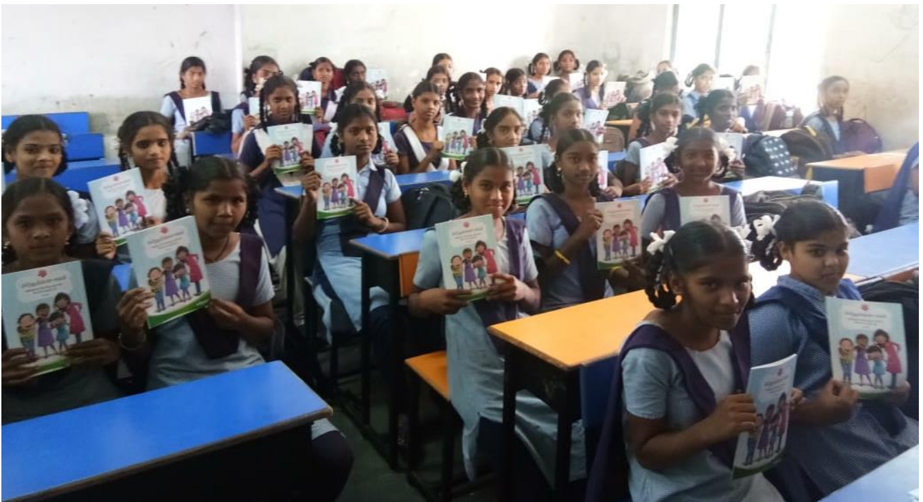
Photograph 6: Distribution of IEC material (Menstrupedia), comic book on MHM