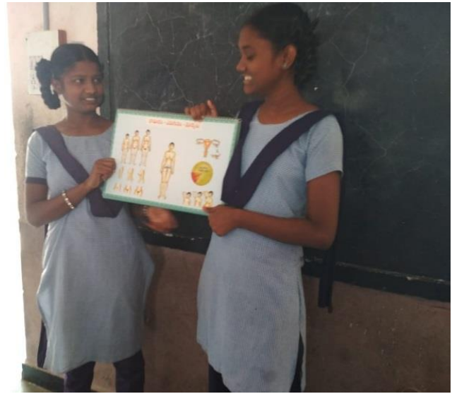
Photograph 5: Flip book on MHM