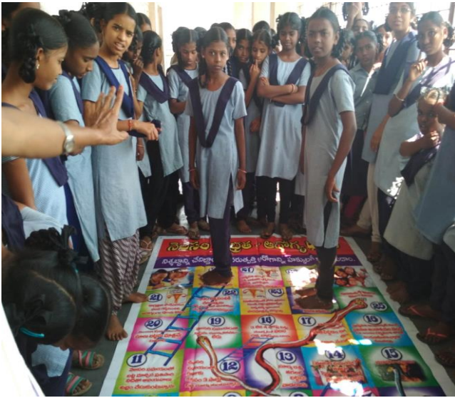
Photograph 4: Snake and Ladder game