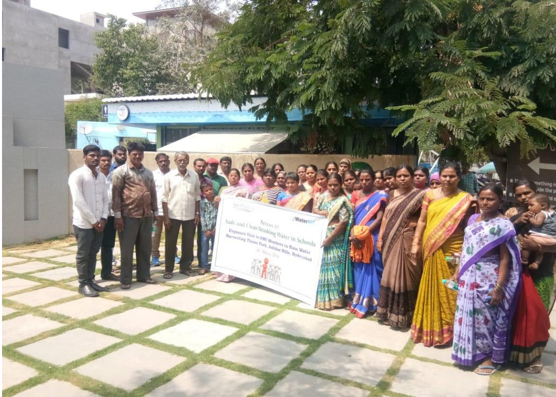
Photograph 10: Exposure visit to SMC Members to Rain Water Harvesting Theme Park