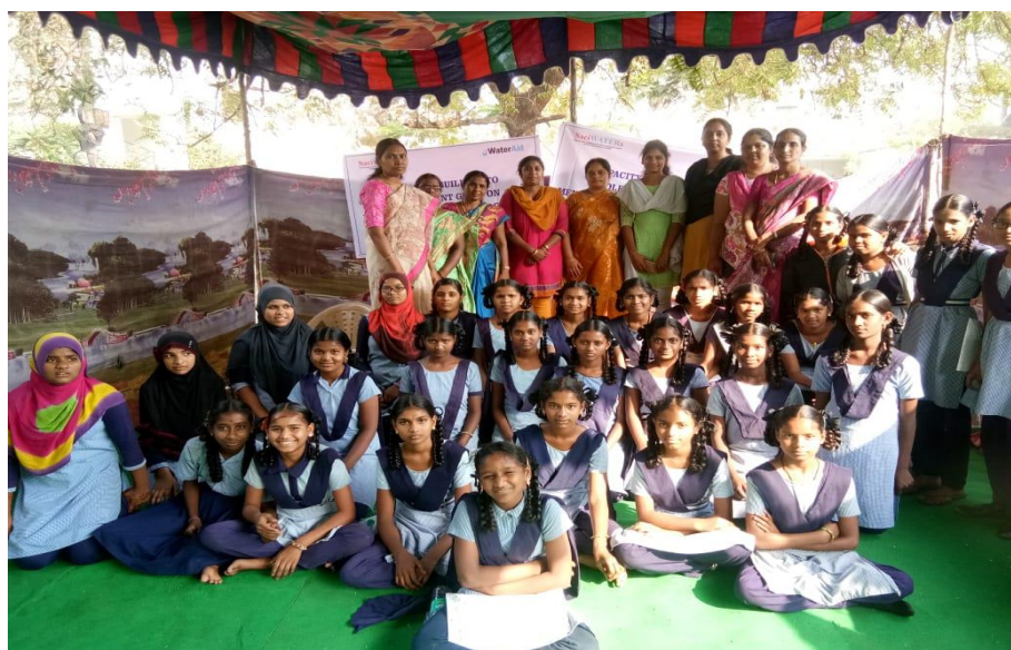
Photograph 3: Capacity Building to adolescent girls on MHM