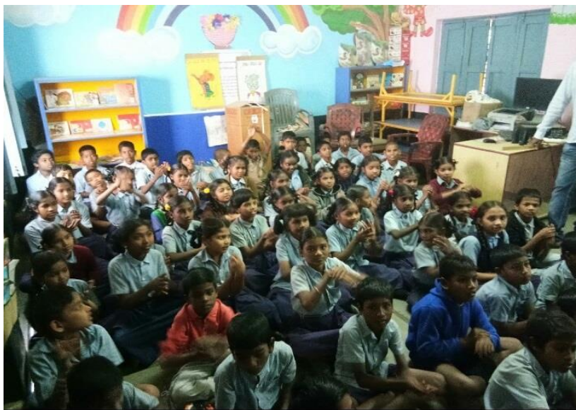
Photograph 2: School students being oriented on 6 steps of handwashing